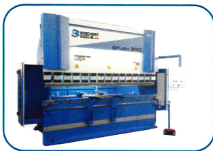
G FLEX series

** The machine is partially in the ground (special foundation required)