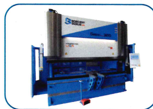
G BEND Plus series