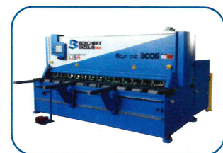
G CUT series