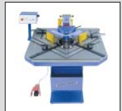
SILVER EAGLE W/ PUNCH (LB13-KS)