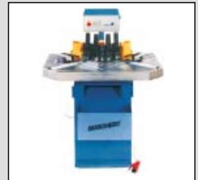
GOLDEN EAGLE (LB15/2000)

(Photos show machines with guards removed)